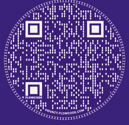
Scan to learn more on our website